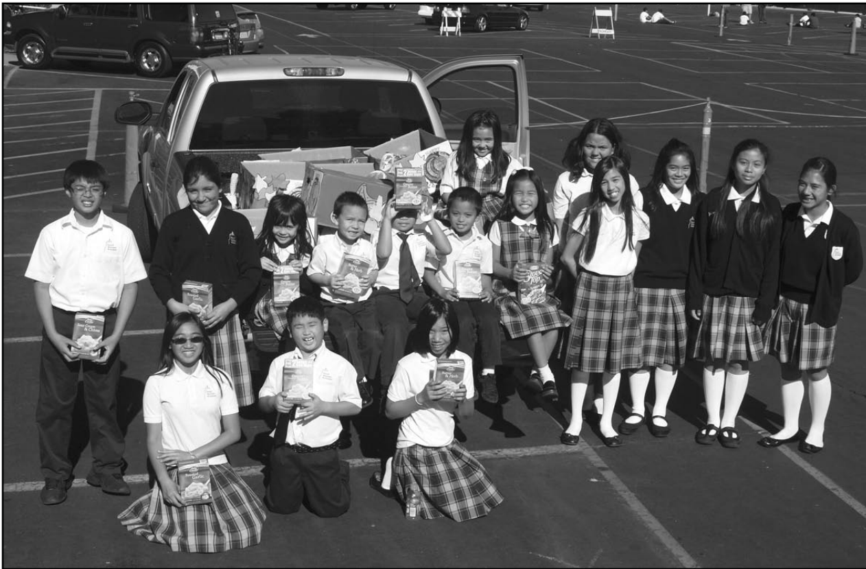
Students from St. Michael Academy whose entire student body collected food for Thanksgiving.

The children of St. Michael Academy collected a whole truckload of Thanksgiving food for families that included complete meals complete with turkeys. All the food was distributed in conjunction with the Western Service Workers to needy families downtown in time for Thanksgiving Day.